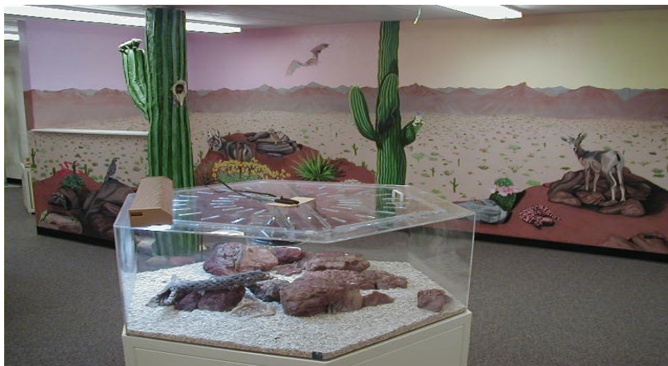
Toad Hall serves as CNUW's learning center and as a gateway for elementary school tours. It includes interactive panels, live animal displays, and a wall mural of Sonoran Desert neighbors (shown above).

With heartfelt thanks for all your generous support and assistance these past five years; we again invite you to our Open House, and encourage you to observe what your assistance has helped to yield, and to further appreciate our continuing and future goals.